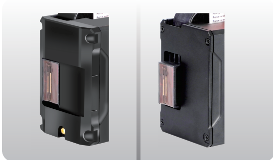
Protruding printhead plates, more flexible for printing on curved surfaces