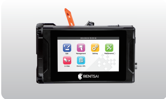
All-in-one design 4.3" touch screen, fast input