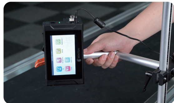
Rotating bracket, anti-shock and easy operation